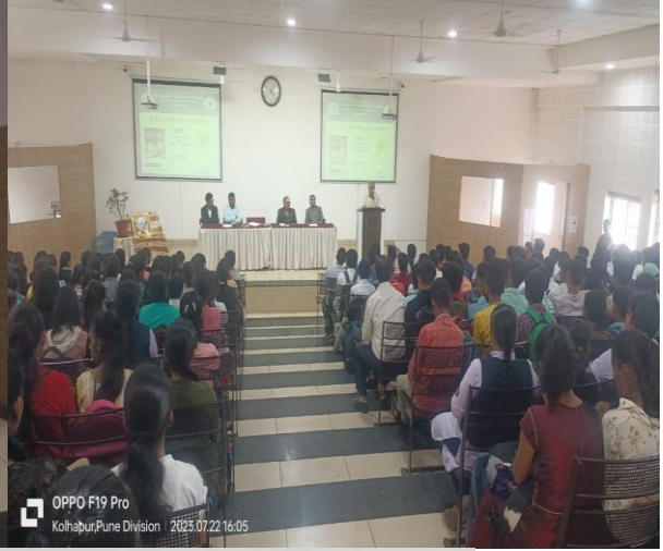
OPPO F19 Pro Kolhapur,Pune Division | 2023.07.22 16:05