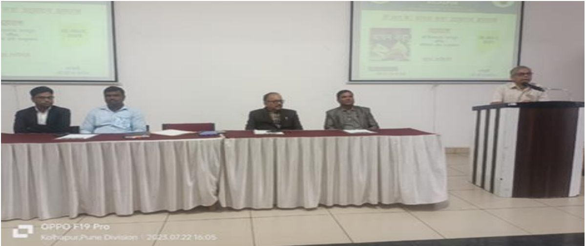
OPPO F19 Pro Kolhapur,Pune Division | 2023.07.22 16:05