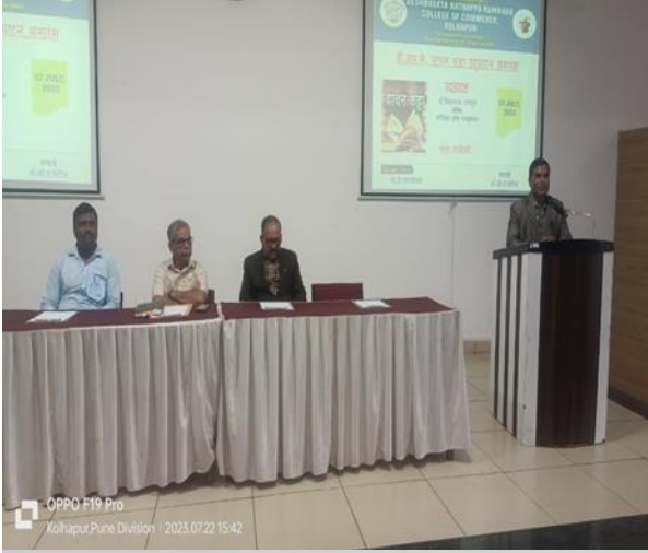
OPPO F19 Pro Kolhapur,Pune Division | 2023.07.22 15:42